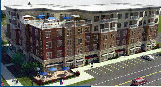
Harbor View Square